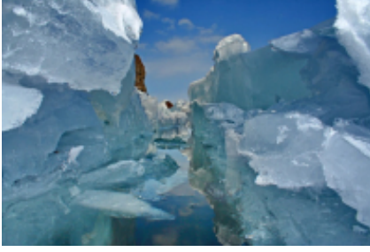
1 - Irkutsk - Listwjanka -