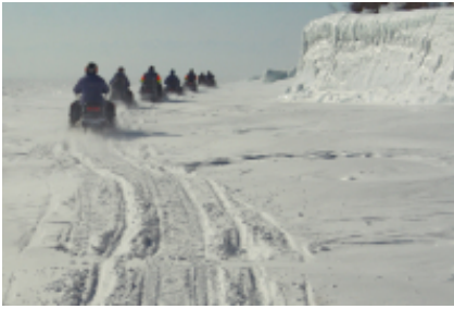
3 - Vydrino - Bolshiye Koty -