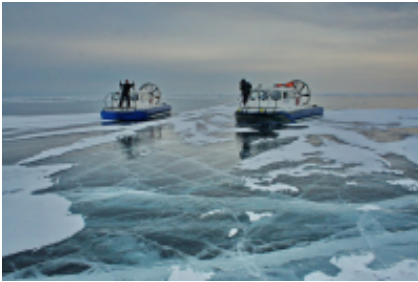
2 - Listwjanka - Listwjanka -