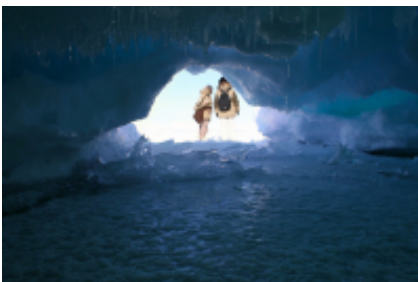
5 - Irkutsk - Irkutsk -