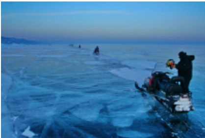
4 - Irkutsk - Irkutsk -