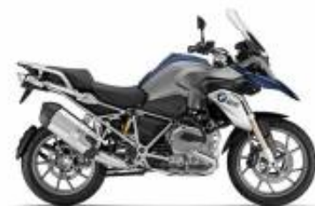
R 1200 GS + $342.88