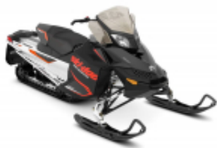
Bombardier 600 + $0.00