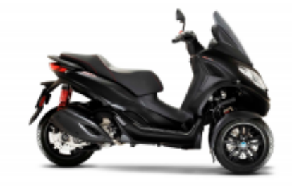
MP3 300 + $0.00