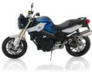
F 800 R + $719.86