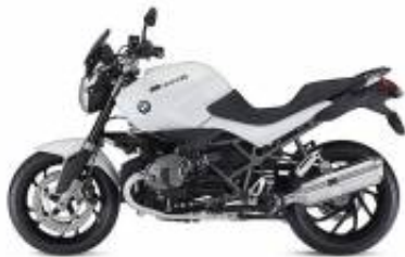
R 1200 R + $719.86