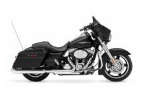
Street Glide + $0.00