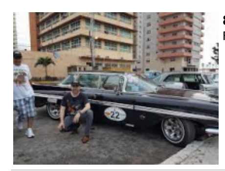
8 - Varadero - Varadero - 150 FREE DAY IN VARADERO. Beach & Relax

9:00 am Departure from Trinidad towards Varadero, crossing the mountain massif on the county road to Manicaragua, if road conditions allow in Santa Clara we will visit Ernesto Che Guevara square and where the mausoleum that keeps its remains and those of its fallen fighting partners in Bolivia in 1967, Lunch at Local Restaurant, after lunch we continue the trip to Varadero (Approximate distance traveled in the day: 330 Km). Hotel in Varadero 4 stars. T Plan