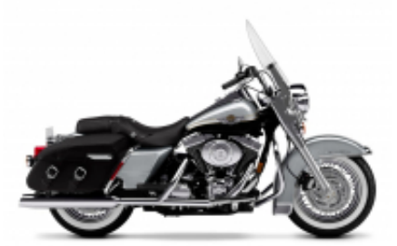
Road King + $0.00