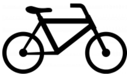
La meva bicicleta