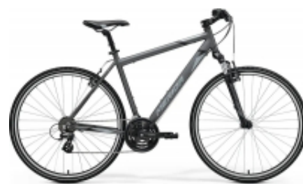
Crossway 20 Man