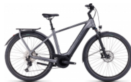
Touring Hybrid 500 One