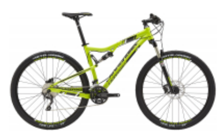
29" Rush 2 + $37.36