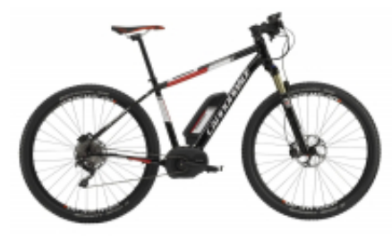
29" Tramont 2 + $46.70