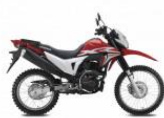
XR 190 + $0.00