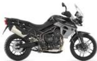
Tiger 800 XRX + $0.00