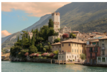
1 - Milà - Milà - 0