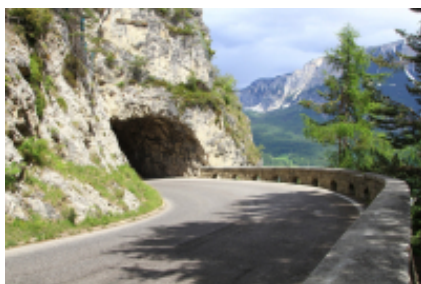
2 - Milà - Meran - 334