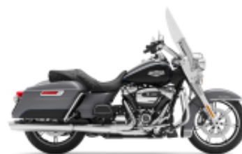
Road King Street Classic Class + $701.42