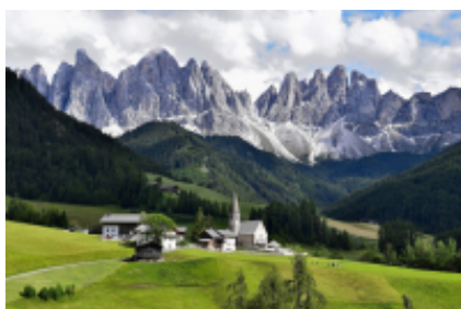
4 - Cortina - Canazei - 209