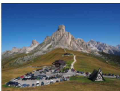
6 - Riva del Garda - Milà - 260