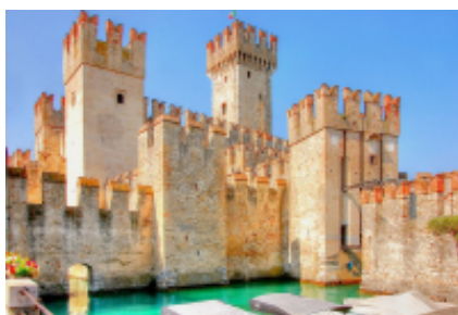
5 - Canazei - Riva del Garda - 254