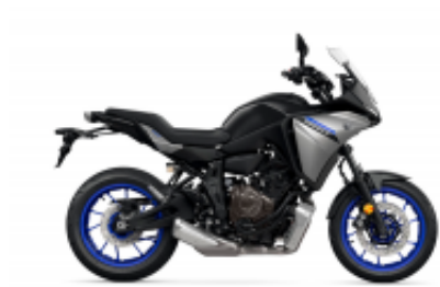
Tracer 700 + $58.03