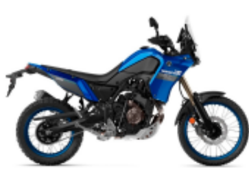
Tenere 700 + $69.64