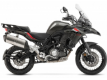
TRK 502 X + $0.00