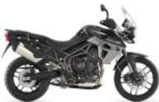
Tiger 800 XR + $600.00