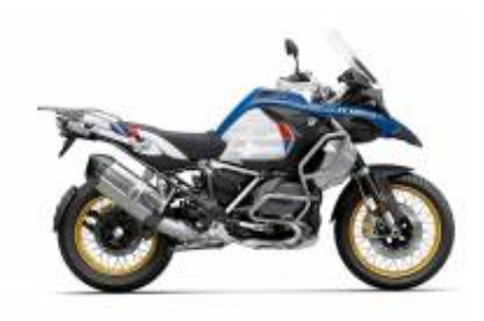
R 1250 GS Adv LC + $279.62