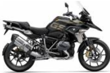
R 1250 GS LC + $92.98