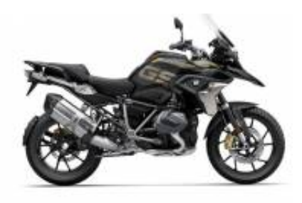
R 1250 GS LC + $139.47