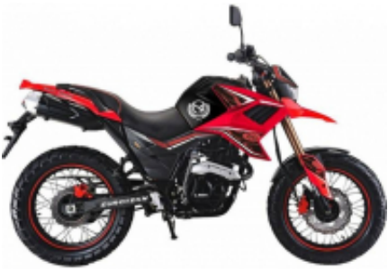
Fuego Tekken 250 + $0.00