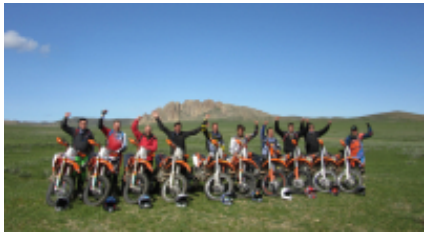
8 - Ulan Bator - Ulan Bator - Depart.