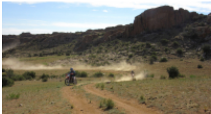
7 - Jargalant - Ulan Bator - Return to Ulaanbaatar.