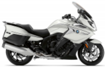
K 1600 GTL + $677.38