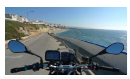
1 - Lisboa - Sagres -

Lisbon to Sagres on the Atlantic Route visiting Portugal's most unspoiled beaches.