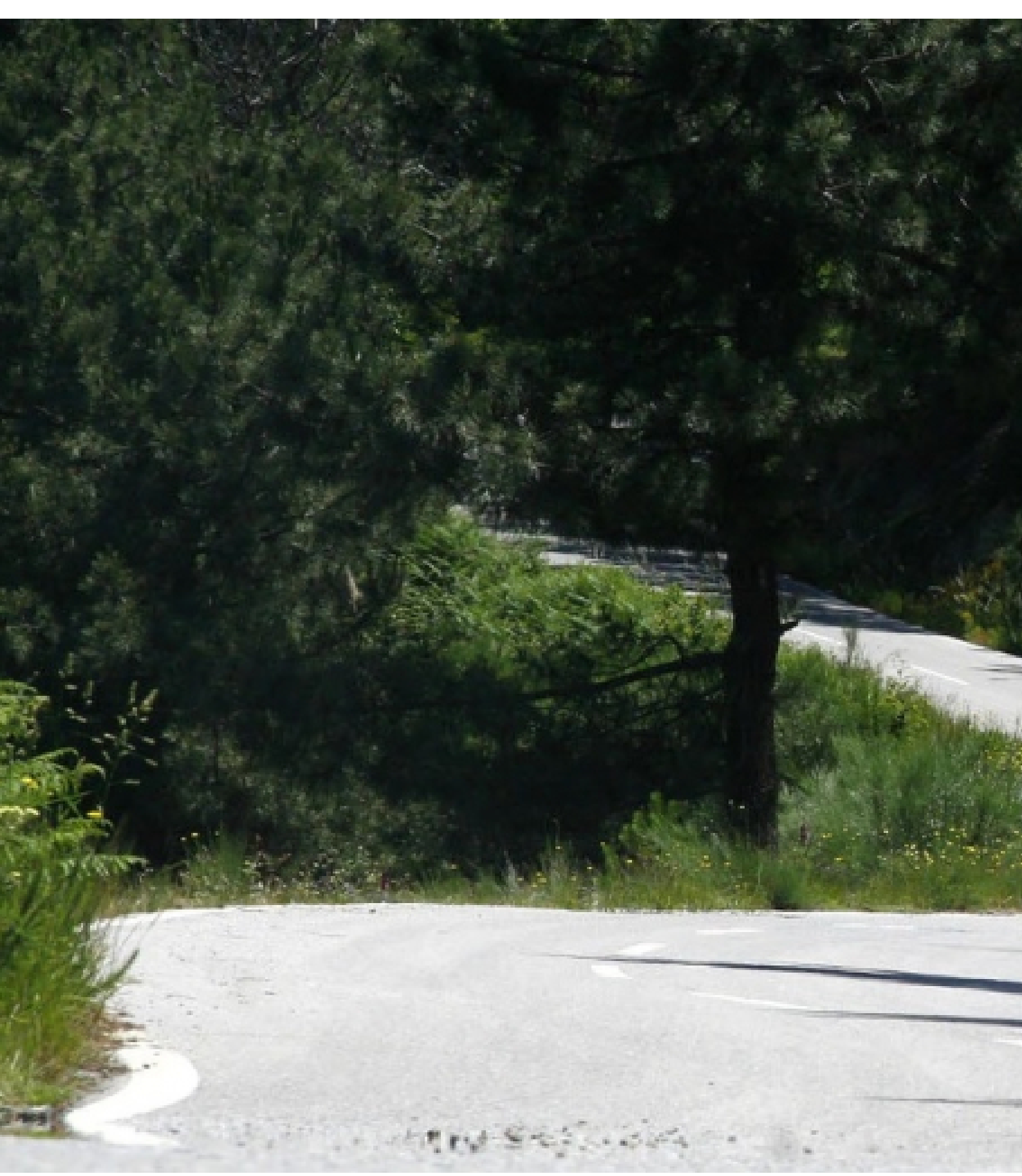
Motorcycle dual-purpose and Adventure Portugal, Sun Escape