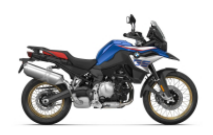
F 850 GS + $351.19