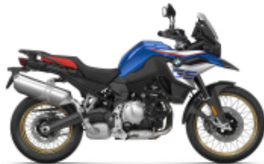
F 850 GS + $290.87