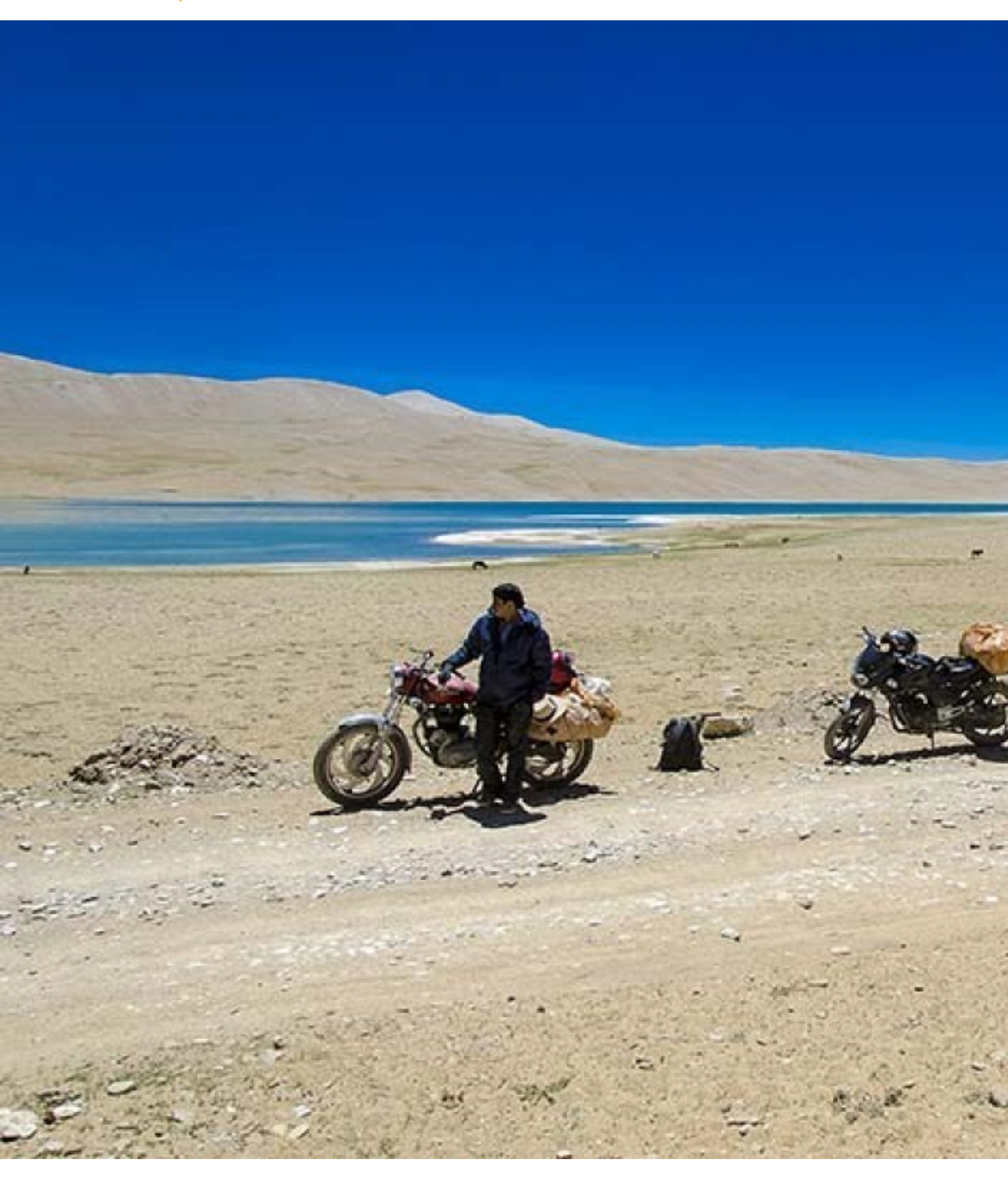
Ladakh Motorcycle dual-purpose and Adventure (Ex - Delhi)