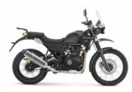
Himalayan 411 + $116.23