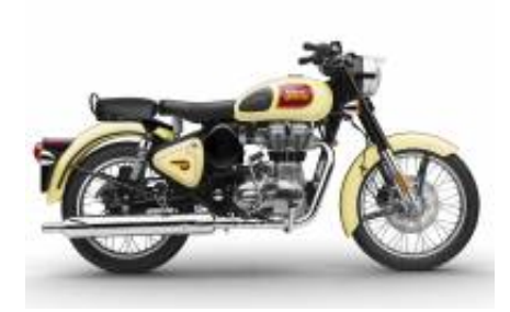
Classic 500 + $58.11