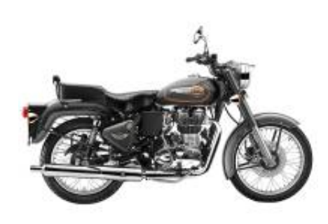
Bullet 500 + $58.11