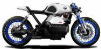
K75 Cafe Racer + $0.00