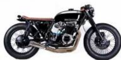
CB 500 Cafe Racer + $0.00