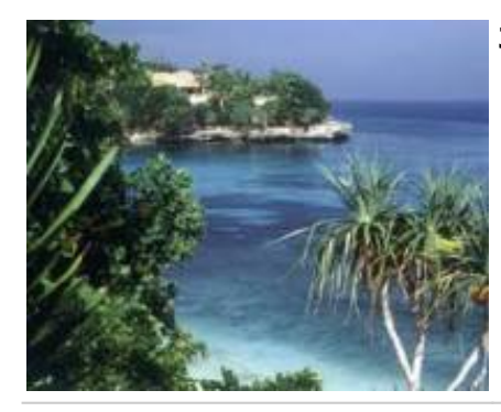
3 - Pekutatan - Negara -