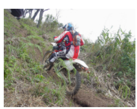
5 - Tabanan - Tabanan -