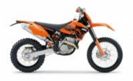
EXC 250 + $691.93