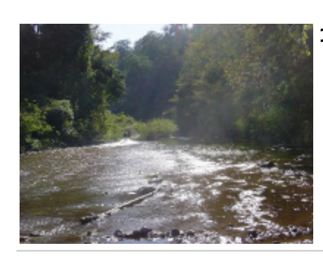
1 - - Nusa Dua -