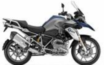
R 1200 GS + $406.58