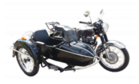
Classic 500 with Sidecar + $0.00