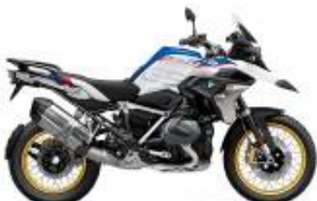
R 1250 GS HP Edition + $0.00