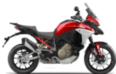
Multistrada V4 + $0.00