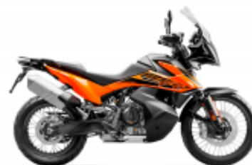
890 Adventure + $0.00