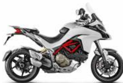
Multistrada 1260 V4 + $0.00