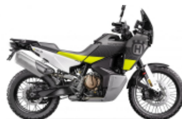
Norden 901 + $0.00