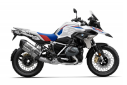
R 1250 GS + $116.85