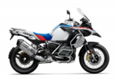
R 1250 GS Adventure + $175.27