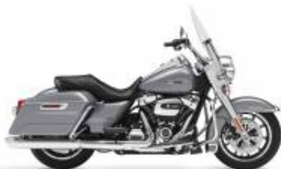
Road King (Gen) Cruiser Touring Class + $280.00