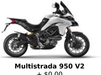
Multistrada 950 V2 + $0.00