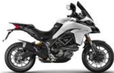
Multistrada 950 V2 + $406.79