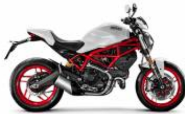
Monster 797 + $406.79