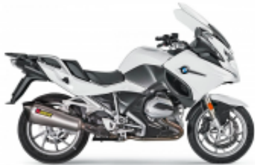
R 1200 RT + $464.90