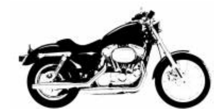
Rally 300 + $0.00