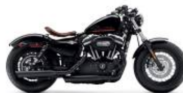
Sportster 1200 + $0.00