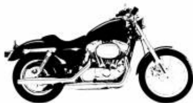
Road Glide GPS incl. Touring Class + $0.00