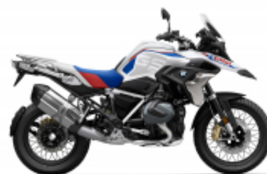
R 1250 GS + $564.88