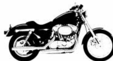
R 18 Transcontinental + $609.47